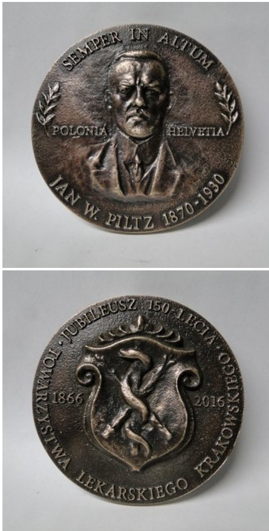
Figure 3. The medal in honour of Prof. Piltz.

Jagiellońskiego w Krakowie w 100-lecie powstania. TLK, Kraków 2015), TLK minted a medal designed by Prof. Karol Badyna (Fig. 3).